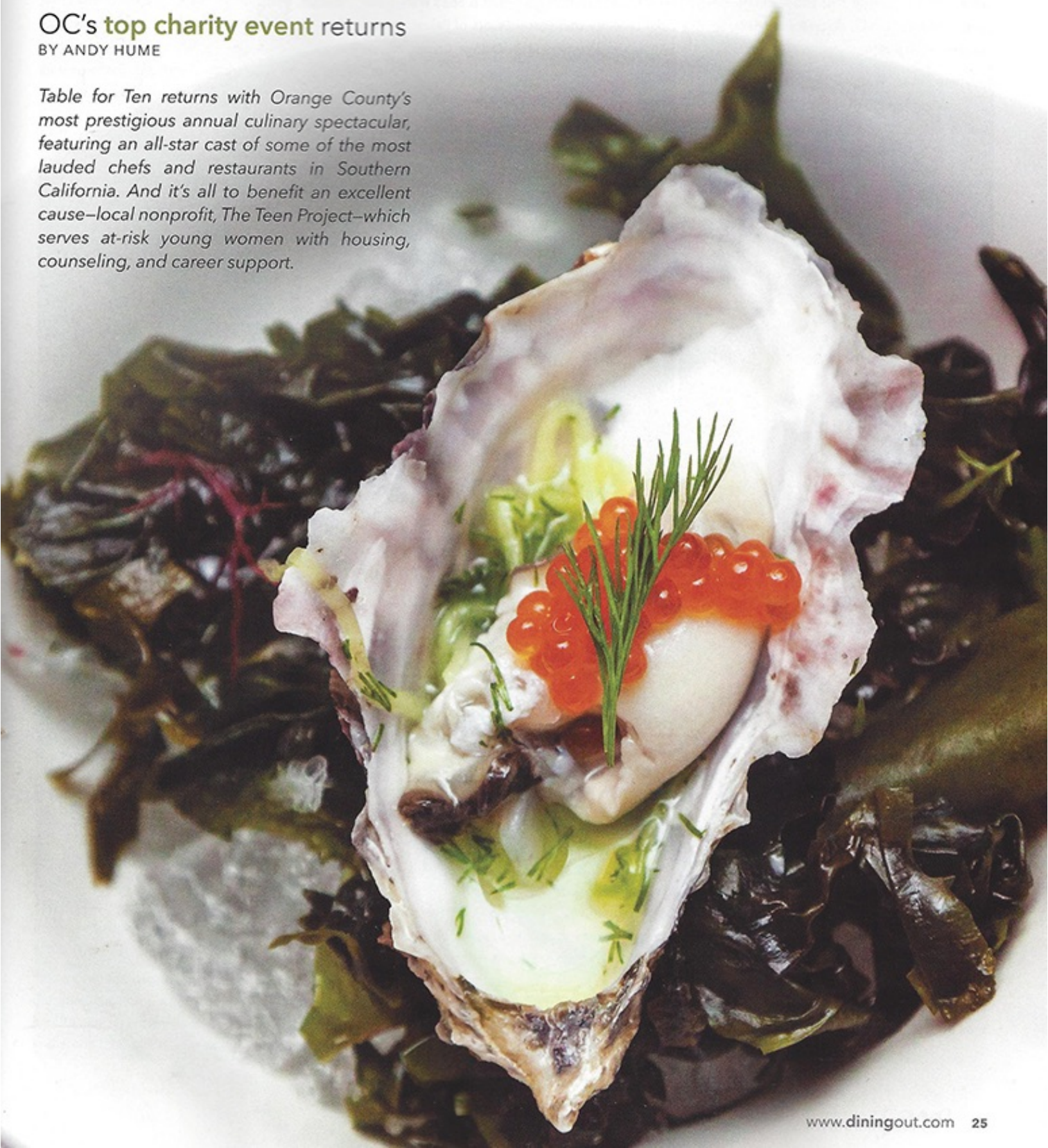
Table for Ten returns with Orange County's most prestigious annual culinary spectacular, featuring an all-star cast of some of the most lauded chefs and restaurants in Southern California. And it's all to benefit an excellent cause—local nonprofit, The Teen Project—which serves at-risk young women with housing, counseling, and career support.