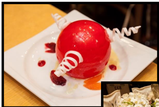
Table for Ten Orange County Culinary Event features 32 Top Chefs composing masterpiece signature dishes prepared tableside for ten guests. At each table, chefs create unique awe-inspiring table designs, cuisine fit for royalty, exquisite wines perfectly paired for each course and a five star “white glove” service. A unique & unforgettable dining experience you won’t want to miss!