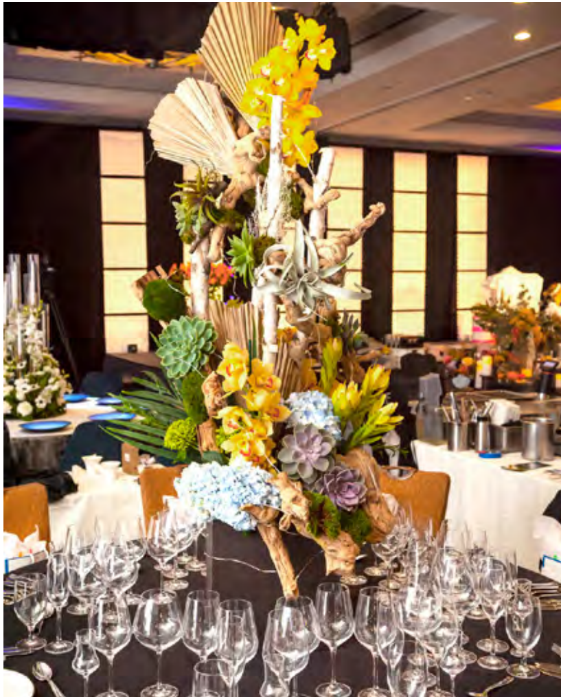
Table for Ten Orange Country Culinary Event features top chefs composing masterpiece signature dishes prepared tableside for 10 guests.

At each table, chefs create unique awe-inspiring table designs, cuisine fit for royalty, exquisite wines perfectly paired for each course and a five star "white glove" service.